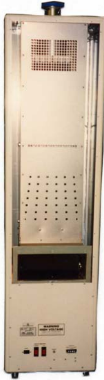
Model 6725 Access Panels Displaced