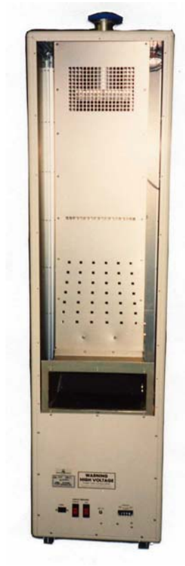
Model 6735 Access Panels Displaced