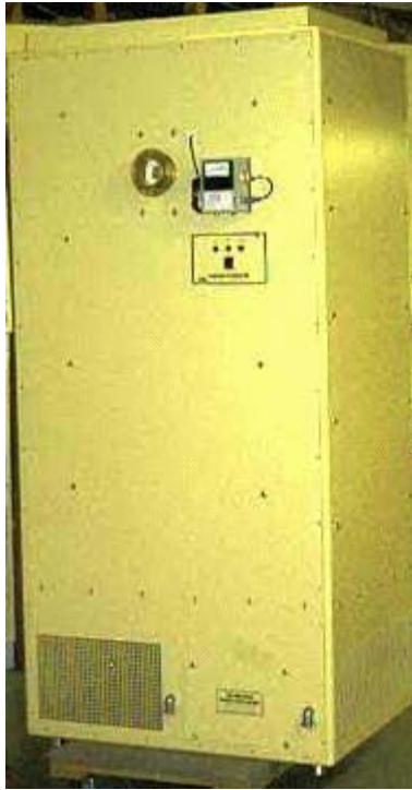
75KW AIR COOLED COAXIAL RESISTOR